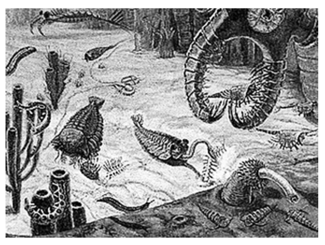
Figure 1. Artist redering of Cambrian period species.

An increase in atmospheric oxygen concentration appears to be a major trend that long preceded the Cambrian explosion. Oxygen first appeared in significant amounts on Earth 2.3 to 3 billion years ago, when various microorganisms released oxygen into the atmosphere. Cyanobacteria greatly contributed to the release of free oxygen in the atmosphere through their photosynthetic processes (5). A second major oxygenation event, which occurred approximately a billion years ago, was a strong driving force that supported the development of complex organisms during the Cambrian era (6). During the past 700 million years, atmospheric oxygen levels have remained relatively stable at the 21% that is observed today (7). The link between rising oxygen levels and complexity is confirmed by a number of events. For instance, oxygen levels rose from 10% to 21% about 425 million years ago, and at this same time, vertebrates evolved and attained